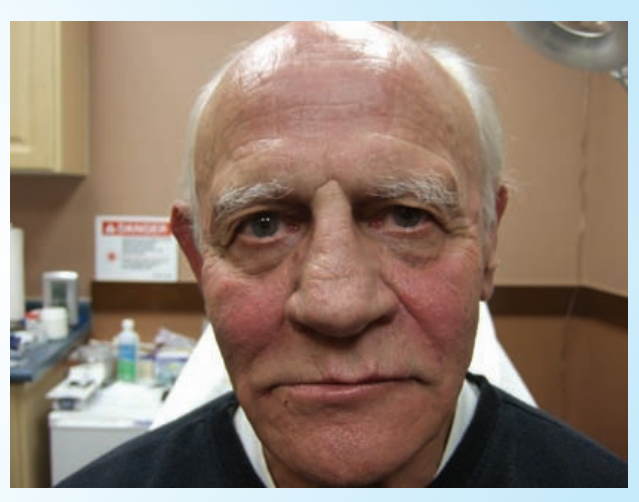
Immediately after Restylane Injection