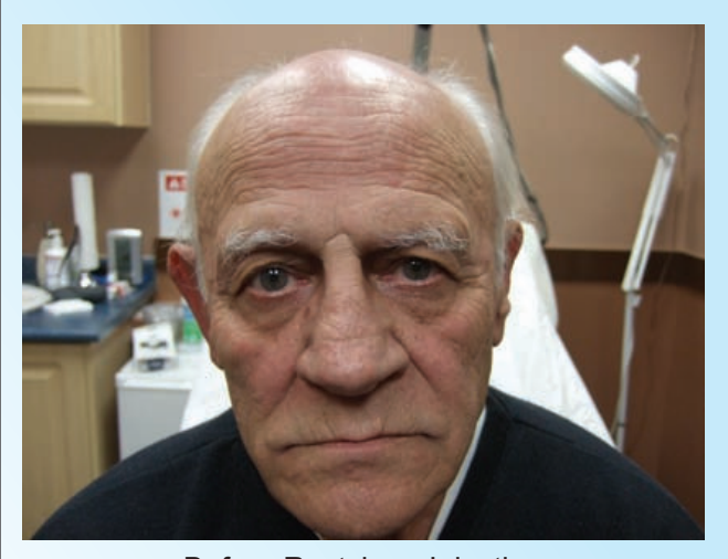
Before Restylane Injection

Hopefully this article shed some light on the principle of "anti-aging."